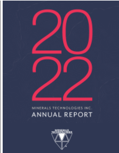
2022 Annual Report